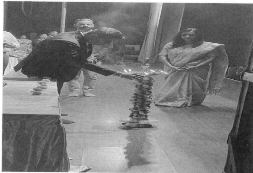
Lighting of lamp