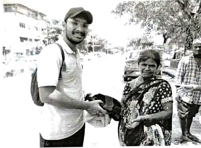
Clothes Donation to needy and poor