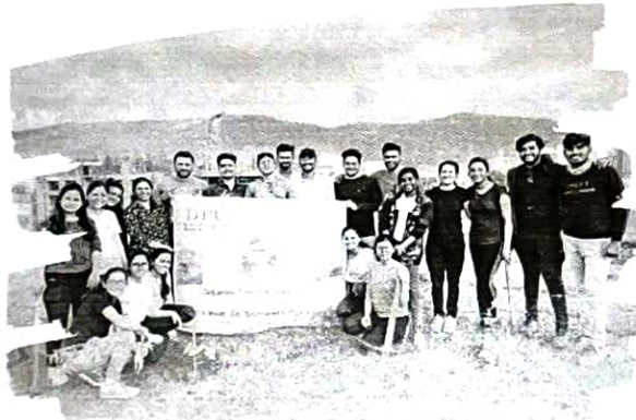
Tree Plantation Activity