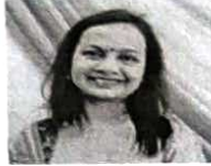
Assistant Professor, KJSIET