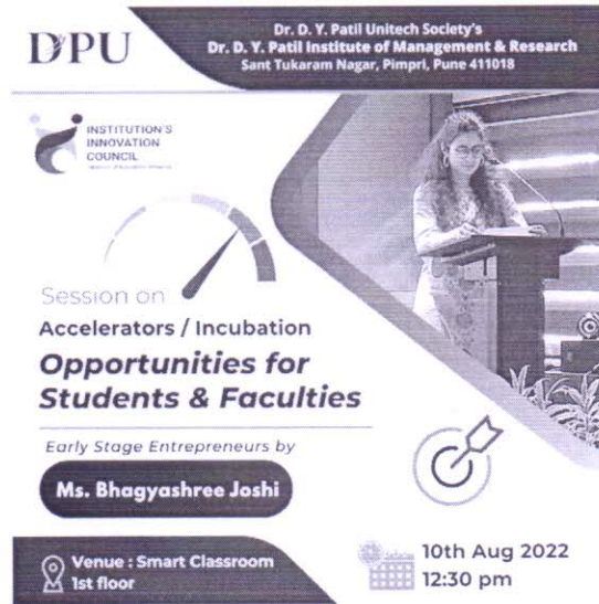
Flyer of the programme